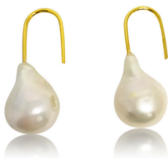
27. White Baroque Pearl Pendant Gold Necklace; 28. Silver Grey Baroque Pearl Stud Earrings in Gold Plated Sterling Silver; 29. White Baroque Pearl Drop Earrings, 18ct Yellow Gold Plated Sterling Silver; 30. White Baroque Pearl Stud Earrings in Gold Plated Sterling Silver