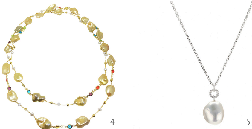
1. 14ct Gold White Baroque Pearl Pendant; 2. Baroque Pearl Drop Earrings with Swarovski Crystal in Rose Gold; 3*. Giant White Baroque Pearl Necklace; 4. Golden Keshi Pearl Long Necklace with Multicolour Gems; 5. Irregular White Pearl Pendant on Sterling Silver Chain; *can be ordered in strand

Baroque pearls are not really a type of pearl, the term 'baroque' actually refers to a pearl's shape. Baroque pearls are irregular pearls that can be found in many interesting shapes, such as 'peanuts', 'snowman', 'animal', 'bird', 'flower' and even 'fish' shapes! Baroque pearls are truly unique thanks to them being formed asymmetrically, which makes it impossible to find identical pairs. Due to the unconventional shape, each baroque pearl boasts its own "character," and their beauty is as striking as that of the Tahitian and Keshi pearls. Baroque pearls of different colours and shapes are striking on their own; this is why they look equally alluring in both a simple design and as a part of a complex composition. Also, Baroque pearls have a distinctive appeal because of their very beautiful tints of color and iridescent flashes, which are the result of "pools" of nacre -where the baroque shape creates an area in which the nacre can collect, and is deeper than along other parts of the pearl.