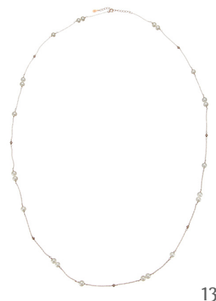
8. Smiley Pearls Pendant with Rose Gold Necklace; 9. White Pearl 24ct. Rose Gold Bracelet with Amethyst; 10. White Pearl 24ct. Rose Gold Bracelet with Blue Sapphire; 11. White Pearl 24ct. Rose Gold Bracelet with Red Ruby; 12. White Pearl 24ct. Rose Gold Bracelet with Yellow Topaz; 13. White Pearls in Rose Gold Chain Long Necklace